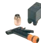
Deckwash Kit for F4B-19 (incl. pressure switch, check valve and trigger nozzle)